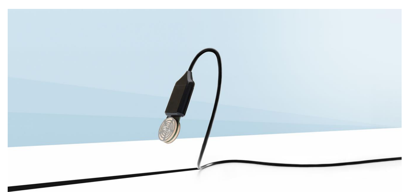
TEROS 21 water potential sensor

Still, Buck has learned a great deal from his work. Considering the wild spatial distribution of summer storms, quantitative green roof performance studies require that rainfall be measured locally. Monitoring of soil moisture content measurements in concert with rainfall and soil lysimeter measurements of drainage, reveal the degree of total and capillary saturation, drainage rate, and porosity available for storage. METER soil water potential sensors, placed within the capillary fringe of water ponded over subsurface drainage layers, can provide useful insights regarding the dryness of the drainage layer and overlying soil, as well as the available storage of stormwater within the drainage layer.